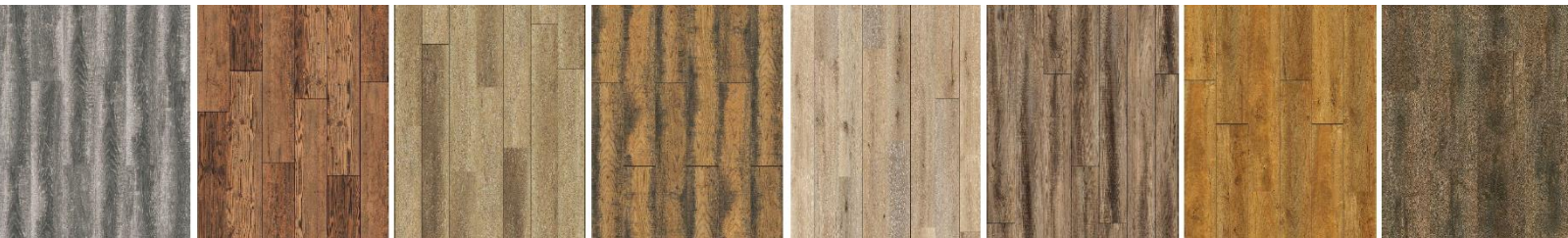
CLOUDLAND (FCD-CL9) FRONTIER (FCD-FT9) PLAINS (FCD-PL9) PRAIRIE (FCD-PR9) SEASIDE (FCD-SS9) SMOKE (FCD-SK9) SUNRISE (FCD-SR9) TWILIGHT (FCD-TL9)

100% WATERPROOF • UV PROTECTION SOUND REDUCTION • COMFORT UNDER FOOT ANTIBACTERIAL • FAMILY / PET FRIENDLY