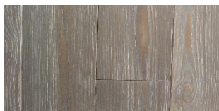
Mercier New Heart Pine (BRB-MERS5)