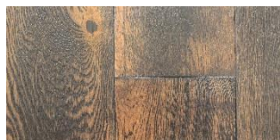
Murphy Junction Oak (BRB-MJUNC7)