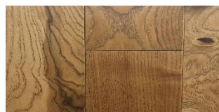
Sugar Creek Hickory (BRB-SCRK5)