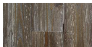
Skeenah New Heart Pine (BRB-SKE5)