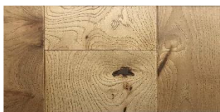
Toccoa River Oak (BRB-TOC5)