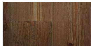
Mackaye New Heart Pine (BRB-MAC7)