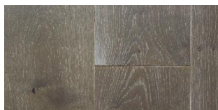
Mineral Bluff Oak (BRB-MBLUF7)