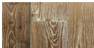
Aska Trail Hickory (BRB-ASKA5)

ENVIRONMENTALLY FRIENDLY: Our production process and species selections all focus on sustainability. We only use non-endangered woods and are producing 4 to 5 times more flooring out of the same lumber normally used to produce one piece of ¾" solid hardwood flooring. Furthermore, our flooring products comply with CARB Phase 2 and have been certified under FloorScore® and GREENGUARD Gold standards.